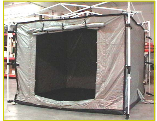
Average Shielding Effectiveness